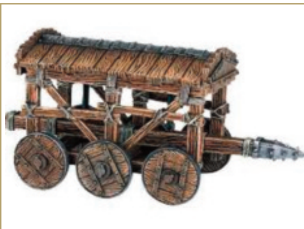
Small Battering Rams