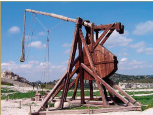
A Mangonel – type of catapult