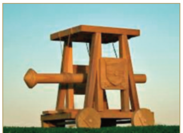
Large Battering Rams