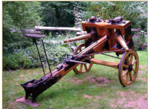
A Ballista – type of Crossbow