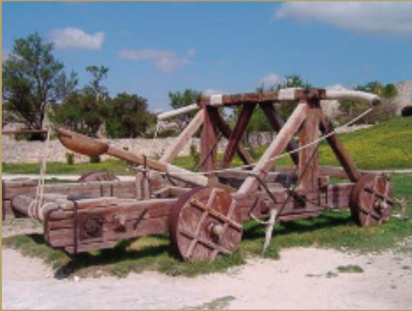
A Trebuchet – throws rocks fast and high