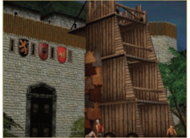
A Siege tower