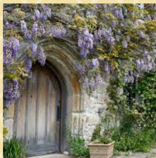
BATTEL HALL WEDDINGS