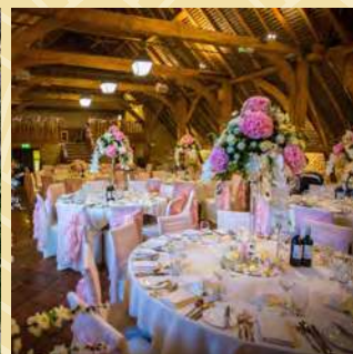
FAIRFAX HALL AND MARQUEE RECEPTIONS