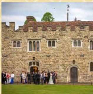
MAIDEN'S TOWER WEDDINGS